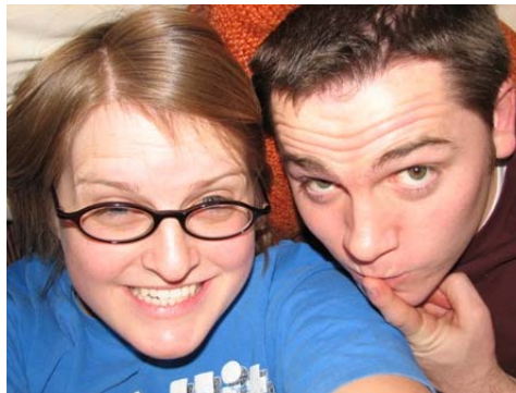
Sometimes we are not serious. ☺