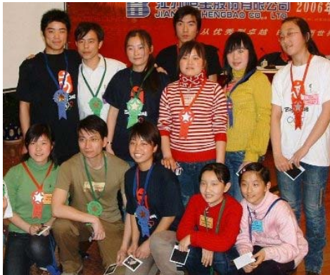
Winners of the game

animal appeared in front of us and did so many incredible movements, we just couldn't control our excitement and clapped our hands all the way through the show.