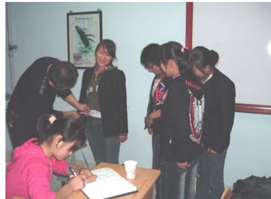
Grade 1 students getting measured for their uniforms.